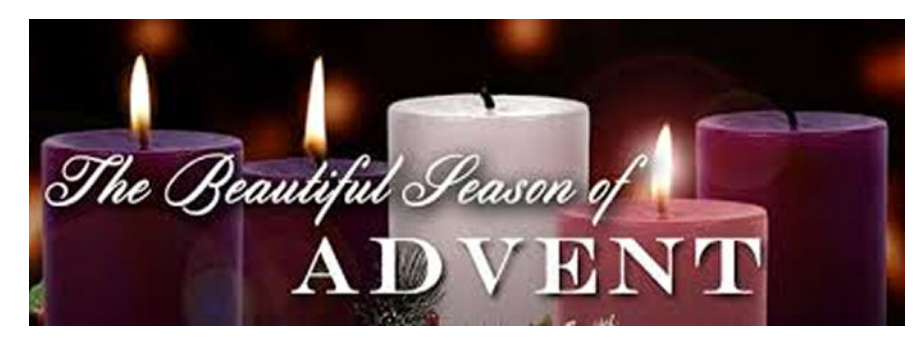
Midweek Worship Wednesdays at 6:30 p.m. December 4, December 11, December 18 Simple Supper: Served from 5:30 p.m. - 6:30 p.m. each Advent Wednesday