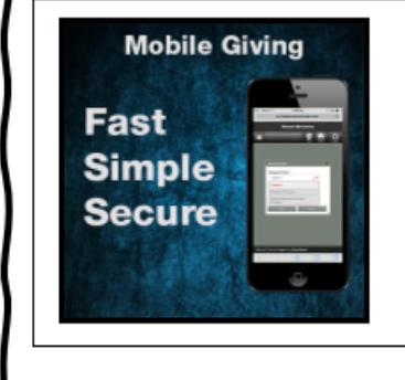
Giving made even EASIER!

Please either write your information on one of the green cards located in the pews or send an email to the church office.