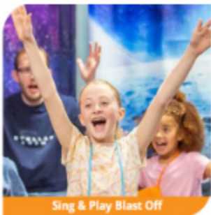
Sing & Play Blast Off